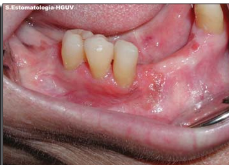
Fig. 2. Erythroplasia.