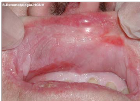
Fig. 4. Proliferative verrucous leukoplakia.