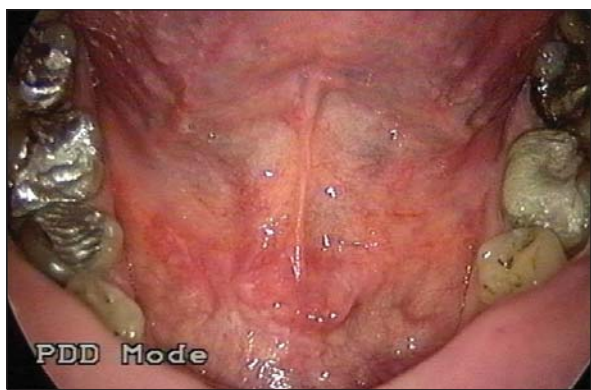
Fig. 10. Clinical view of floor of mouth before spectroscopy.