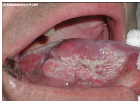
Fig. 1. Carcinoma of tongue.