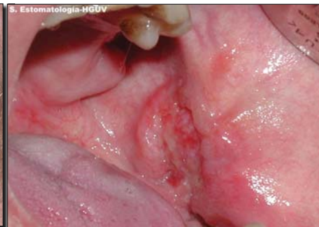
Fig. 8. Carcinoma.