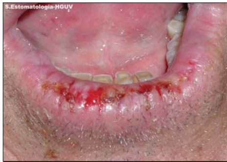
Fig. 7. Actinic cheilitis.