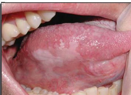
Fig. 3. Leukoplakia.