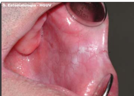
Fig. 6. Candidal leukoplakia.