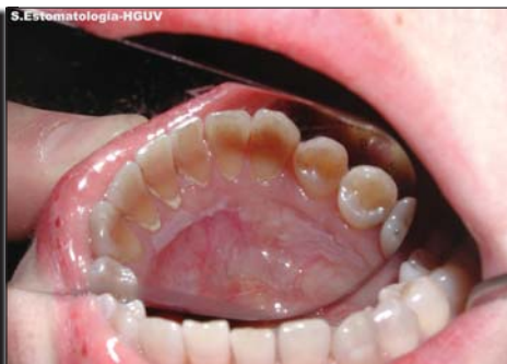
Fig. 5. Sublingual keratosis.